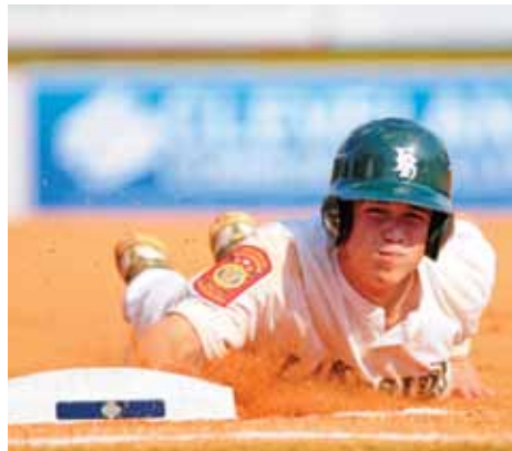
Brooklawn, N.J., handed Lakeside Recovery of Bellevue, Wash., its only two losses.